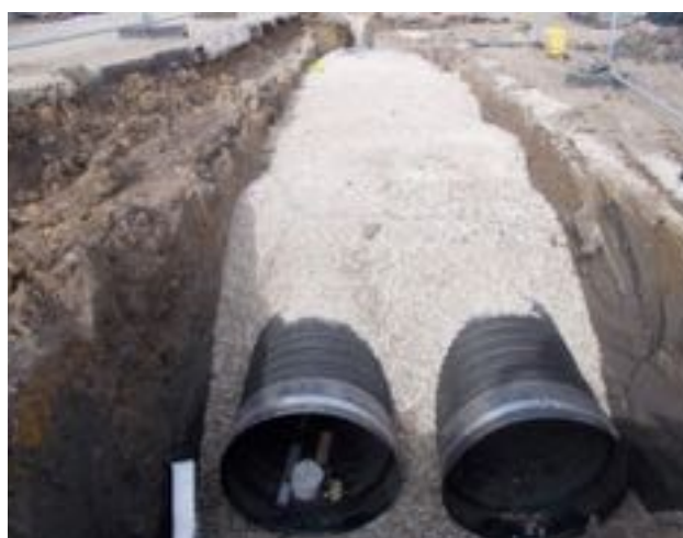
Beckwith Head Road, Harrogate

Most of our future work continues to be known for existing clients. Our simple strategy of meeting or exceeding our client's expectations continues to give us the best chance of repeat business.