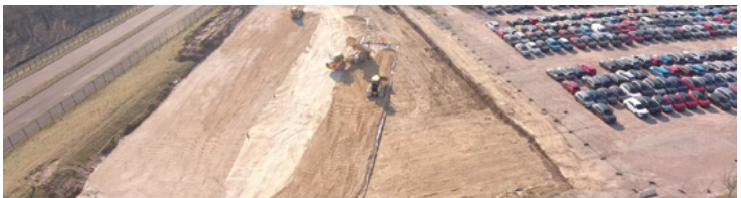
Drone footage of the ongoing earthworks in Rockingham

Stay safe and we look forward to working with you soon.